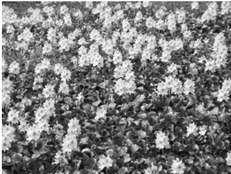
Magnification \times 0.1

In the production of glucose, cellulose from water hyacinths is mixed with the enzyme cellulase. Cellulase breaks down the cellulose to produce glucose.